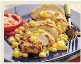
Ranch Oven-Fried Chicken ★★★★★