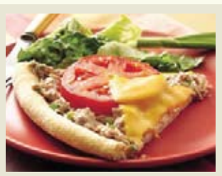
Ranch Tuna Melt Wedges ★★★★★