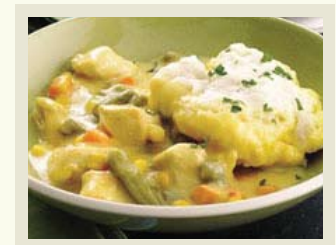
Chicken and Dumplings ★★★★★