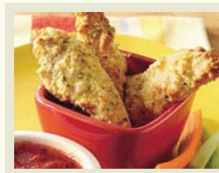
Italian Chicken Fingers ★★★★★