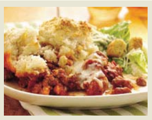
Italian Beef Bake ★★★★★