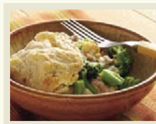
Broccoli and Tuna on Biscuits ★★★★★