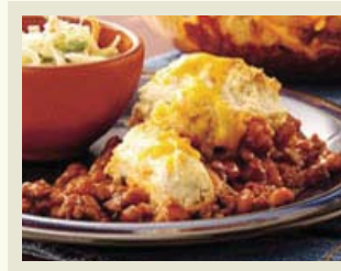
Cowboy Casserole ★★★★★