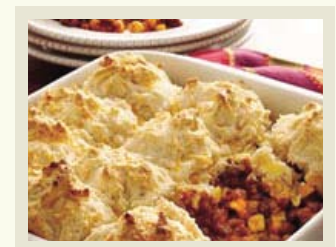
Taco Beef Bake with Cheddar Biscuit Topping ★★★★★

Get more Bisquick recipes at BettyCrocker.com